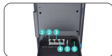
Multiple peripherals connectivity, providing abundant possibilities of extension.