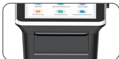
High-speed thermal printer fits 58mm paper roll.